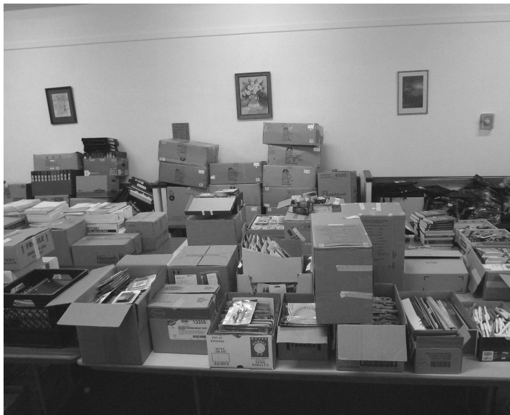
Both pictures above are of the distribution room Friday morning after we set up before the week of the School Supplies distribution. It took 5 vehicles to get all the supplies from our office to the church!